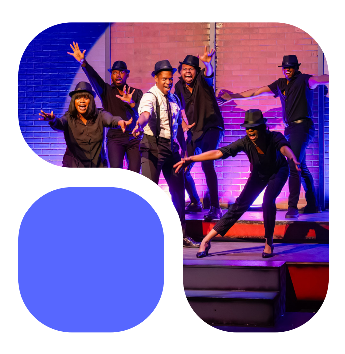
'The Flow: A Night of Monologues' during "Fade to Black Play Festival" (2023). MATCH, Houston, TX.

For collaborative work, one artist must serve as the lead applicant for the program. Contracts and fees will be paid directly to the lead applicant. Collaborators should be equally committed to working together and should have a partnership agreement defining the rights and responsibilities for ownership, fees, and intellectual property of the work. Hiring artists or creatives does not constitute a collaboration.