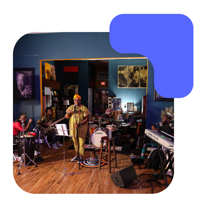
Babatunde and Friends, 'Village Wordsmith' (2023). SAID Institute, Houston, TX.