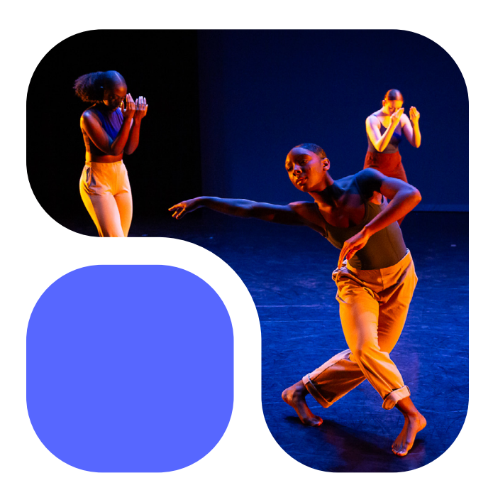
Choreography by Kyle Rucker. "Mind the Gap XXVII" (2023). MATCH, Houston, TX.

Artistic goals, vision, and process are clearly outlined; applicant demonstrates artistic and cultural vibrancy; applicant communicates well-defined public programming that is imaginative and innovative for Houstonians and visitors.