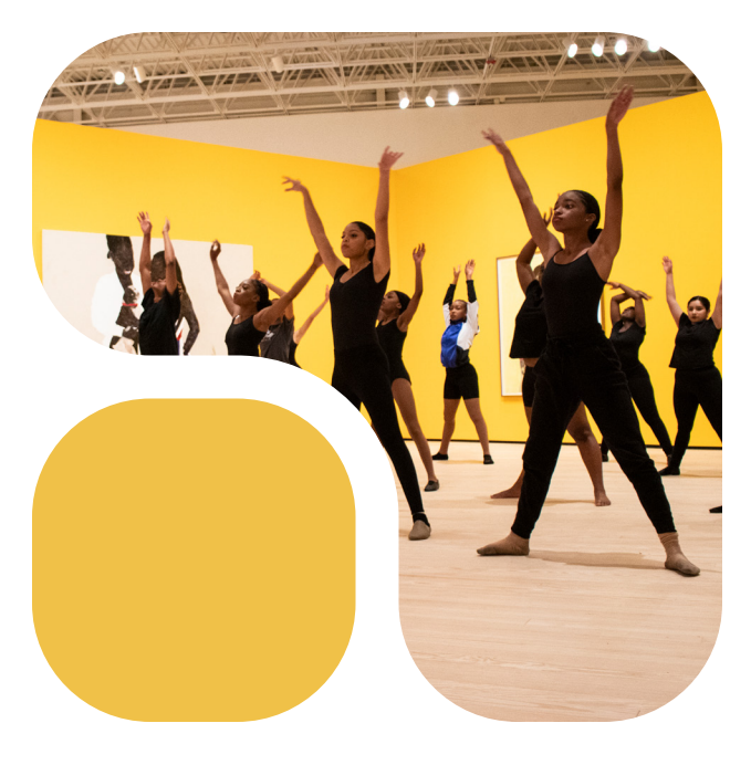
Program during "Amoako Boafo: Soul of Black Folks" (2022).