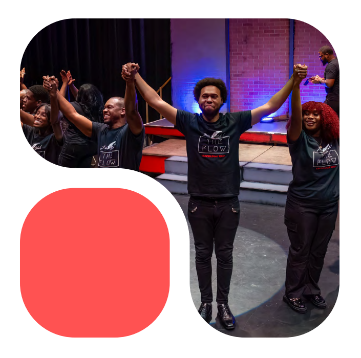
'The Flow: A Night of Monologues' during "Fade to Black Play Festival" (2023). MATCH, Houston, TX.

The applicant should clearly state the detailed information about their public presentation. Public presentations may be ticketed, but they cannot exclude the public or limit who may be a member of the audience. If the event has limited