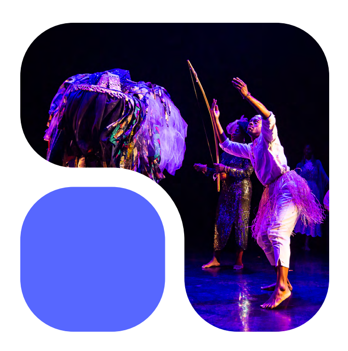
JuJu Strolling Thru, "Barnstorm Dance Fest" (2022). MATCH, Houston TX.

Artistic goals, vision, and process are clearly outlined; applicant demonstrates artistic and cultural vibrancy; applicant communicates well-defined public programming that is imaginative and innovative for Houstonians and visitors.