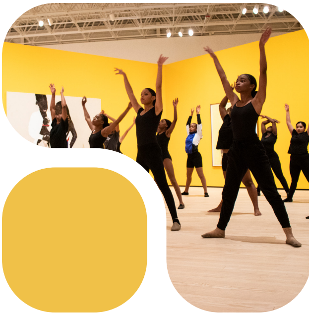
Program during "Amoako Boafo: Soul of Black Folks" (2022).