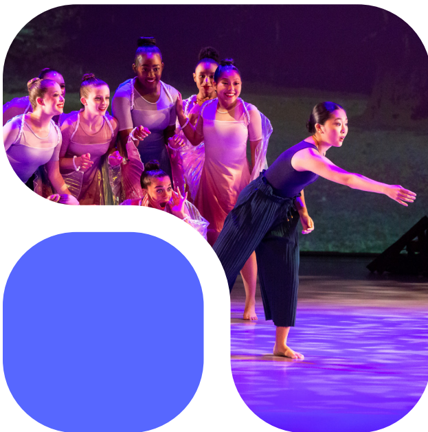
Elizabeth A. M. Keel, Moving Myths (2022). Hobby Center for the Performing Arts, Houston, TX.

All applicants agree to the following processes and grantmaking structures prior to applying. Details specific to each grant program follow this section.