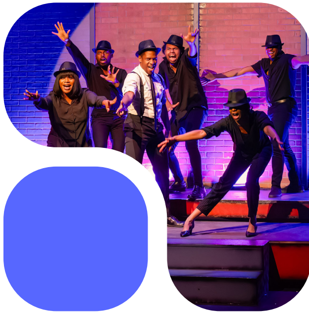
'The Flow: A Night of Monologues' during "Fade to Black Play Festival" (2023). MATCH, Houston, TX.

Applications received by Houston Arts Alliance undergo a multi-step review process, as follows.