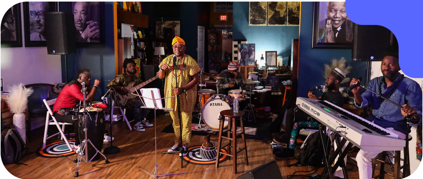
Babatunde and Friends, Village Wordsmith ' (2023). SAID Institute, Houston, TX.

HAA encourages all applicants and grantees to remain in contact with HAA to discuss scope of work and budgeting concerns. HAA is here to help troubleshoot ideas and check if any changes in scope of work conflict with grantees' contracts or these guidelines. You can share information, ask questions, or request a meeting at any time by email through the Support Desk .