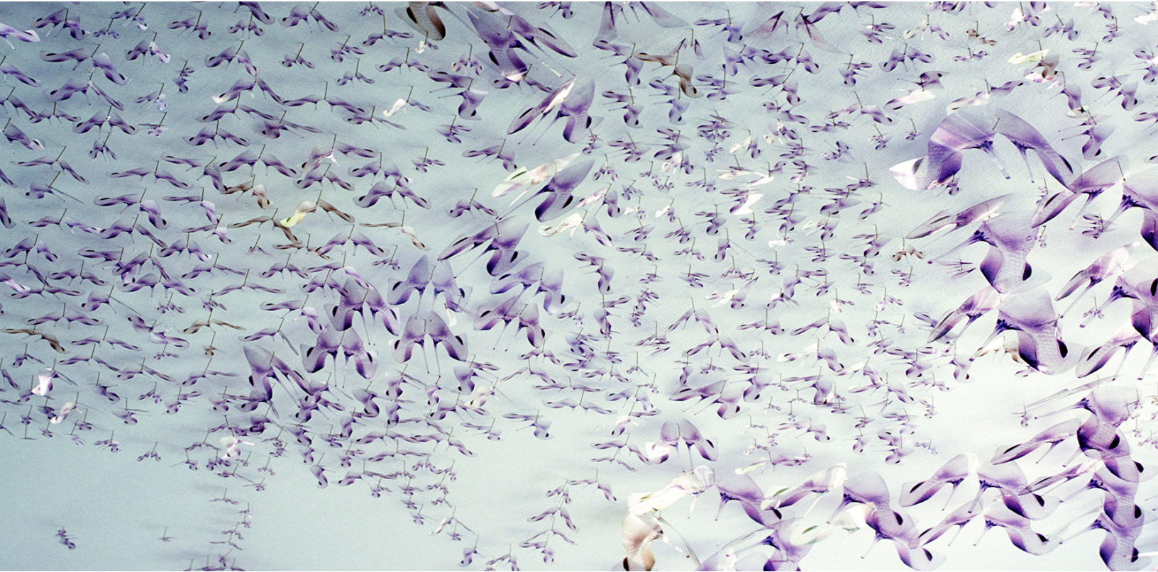
Bennie Flores Ansell Untitled Wayfinding Sign, 2015