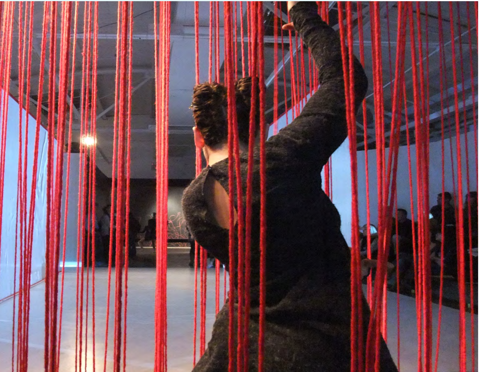
A Crack in Everything , 2012, zoeljuniper, performance and installation at DiverseWorks ArtSpace.