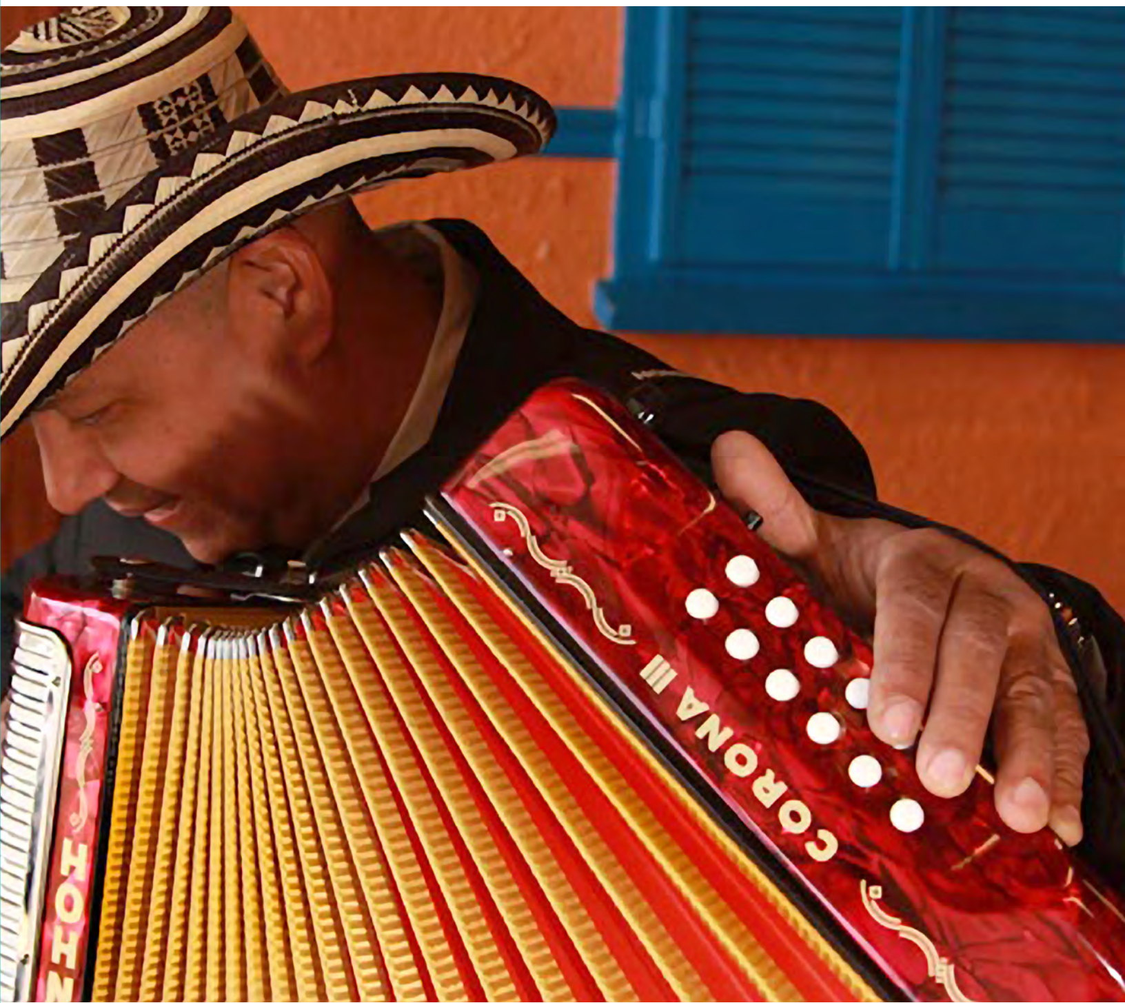
Son Vallenato, 2013.